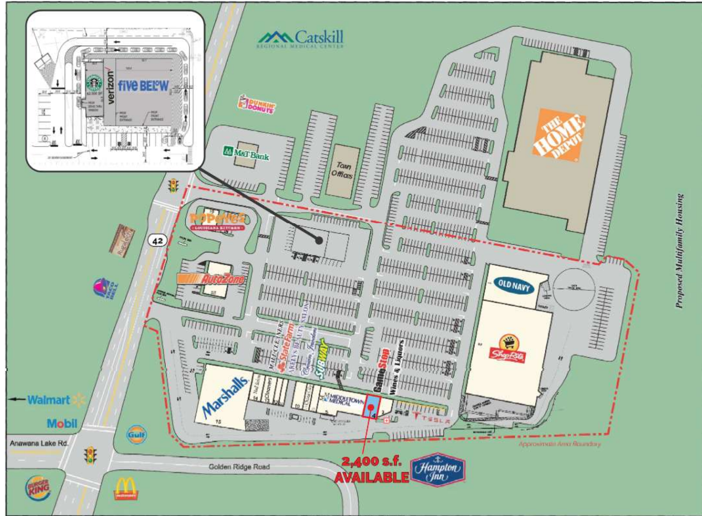
THOMPSON SQUARE 4388 Route 42 North | Sullivan County | Monticello, NY 12701