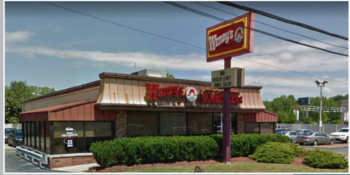
AVAILABLE: 2,500 S.F. (PRESENTLY WENDY'S) DRIVE-THRU WITH BYPASS LANE.

Lot Size: 30,000 s.f. Parking Spaces: 39 (of which 2 are handicap spaces)