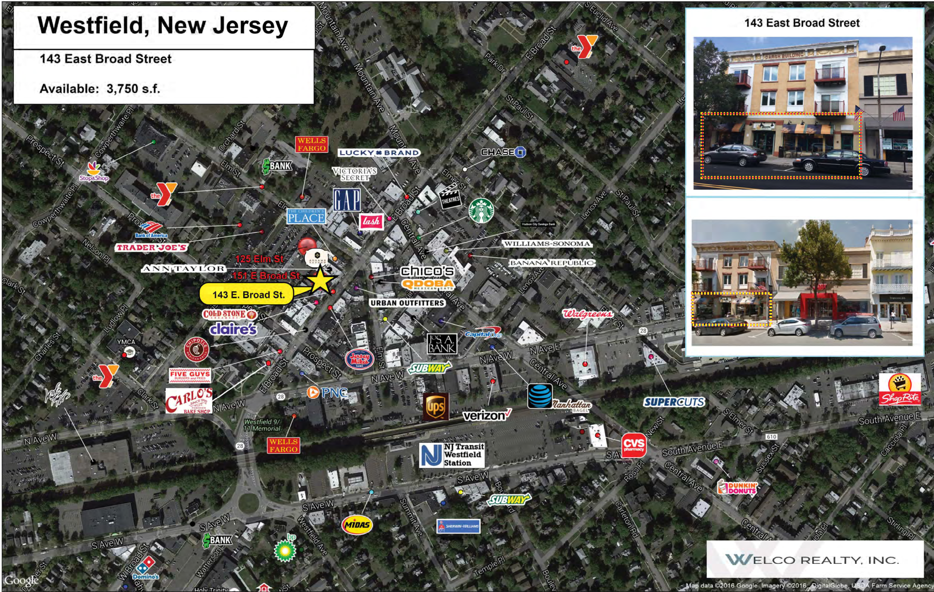
143 East Broad Street