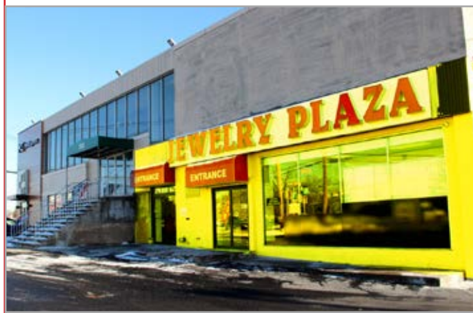
10,000 SF 2nd Floor Retail / Showroom