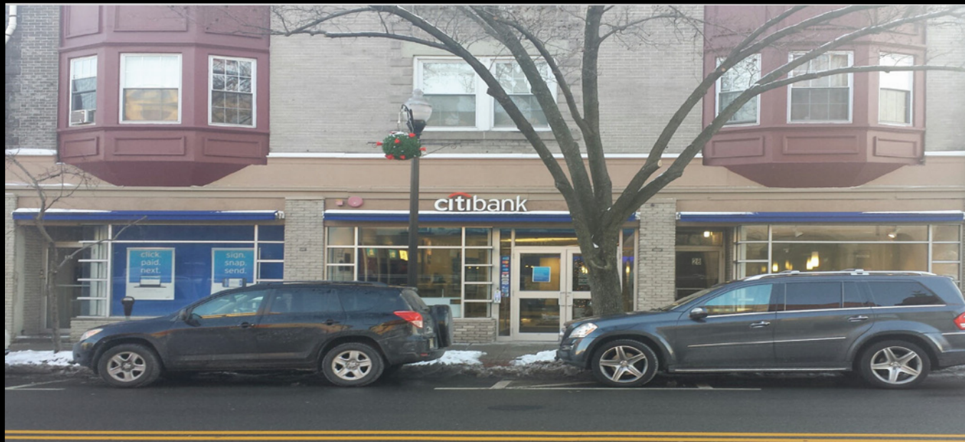
OFF THE CORNER OF EAST RIDGEWOOD AVENUE & NORTH BROAD STREET

JOIN RIDGEWOOD'S HISTORIC SHOPPING DISTRICT!