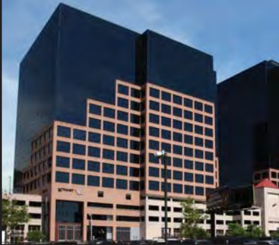
2 Penn Plaza