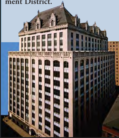
153 Halsey Street

Newark, NJ is home to one of the country's largest shipping ports and the busiest airport in the tri-state area. New York City is only 12 minutes away. The well-developed transportation system includes PATH, Amtrak, airport monorail and highway infrastructure. A highly educated workforce has 4 universities available only minutes away. Contributing to Newark's revival are the NJPAC, Prudential Center and a Special Improvement District.