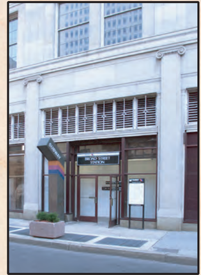
707 Broad Street Subway Entrance