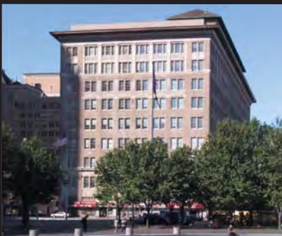
707 Broad Street