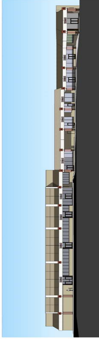
Exterior Rendering Kearny Plaza Shopping Center

Exciting new retail opportunity at a high traffic existing center featuring national retailers such as KMart, Modell's, ShopRite, Avenue, Dress Barn, Dollar Tree / Deal$, Ten Spot & Radio Shack.