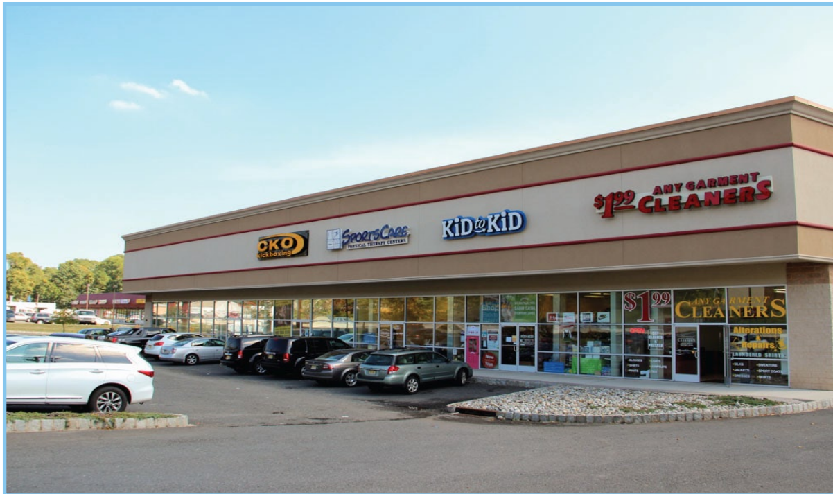
Co-Tenants: CKO Kickboxing, Sports Care Physical Therapy, Kid to Kid Children's Clothing & Cleaners

Easy Access: Situated less than .5 miles to U-Turn intersection in both directions.