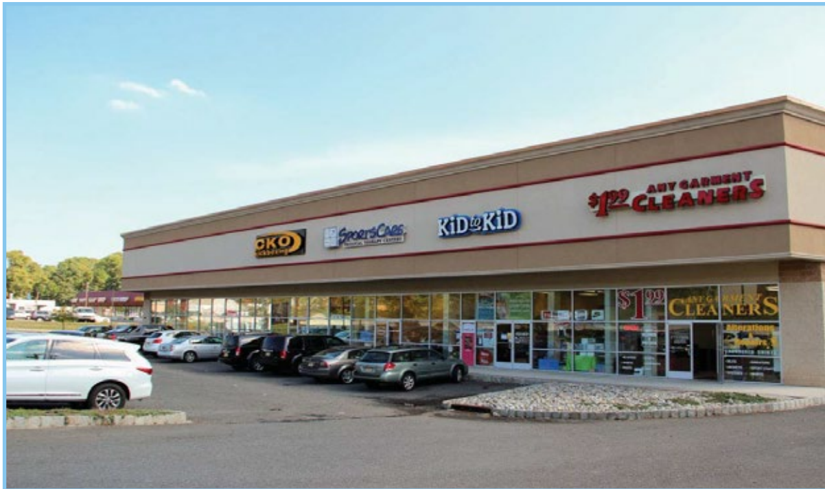
Co-Tenants: CKO Kickboxing, Sports Care Physical Therapy, Kid to Kid Children's Clothing & Cleaners

Easy Access: Situated less than .5 miles to U-Turn intersection in both directions.